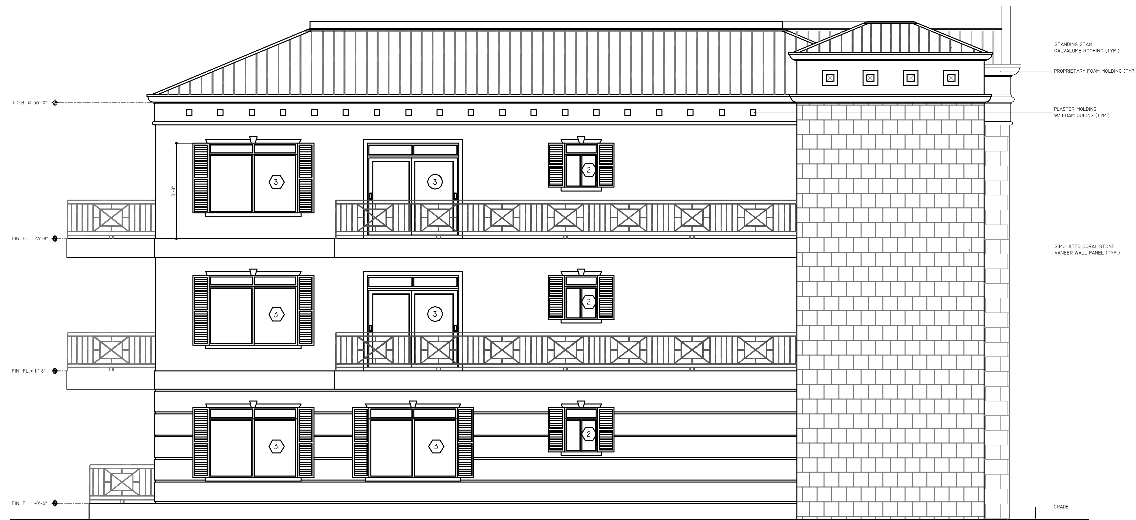
PROPOSED LEFT SIDE ELEVATION: SCALE: 1/4"=1'-0"